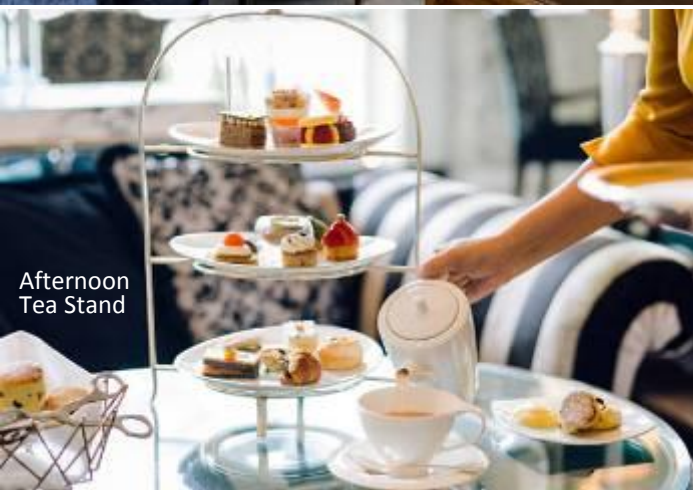
Afternoon Tea Stand